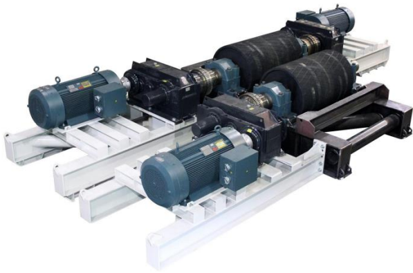
West River Triple 500HP Variable Frequency Drive