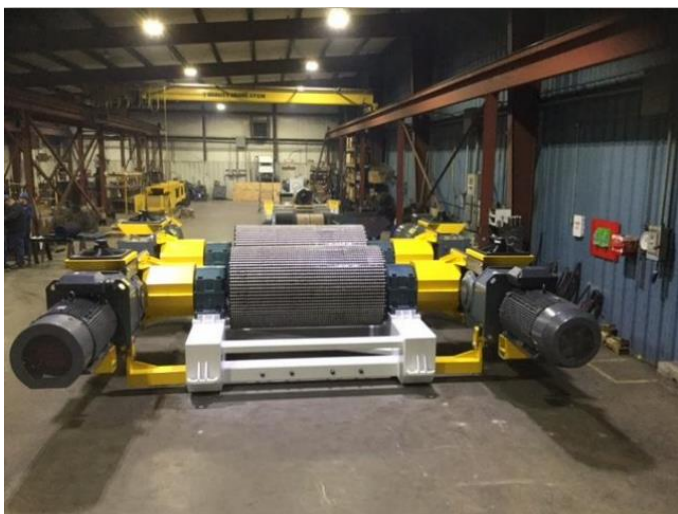
400HP Quad 72" Drive with Fans