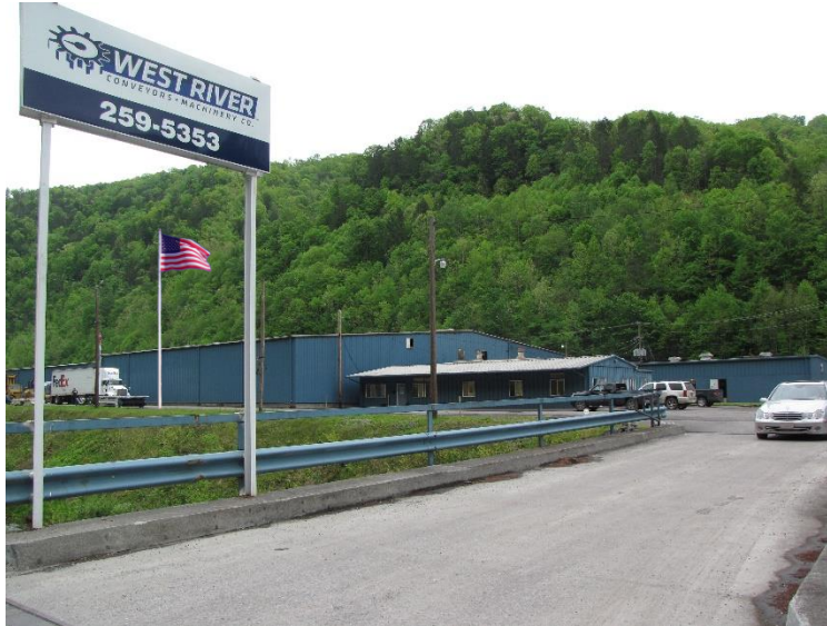
West River Conveyors + Machinery Co. Plant, Oakwood, Virginia