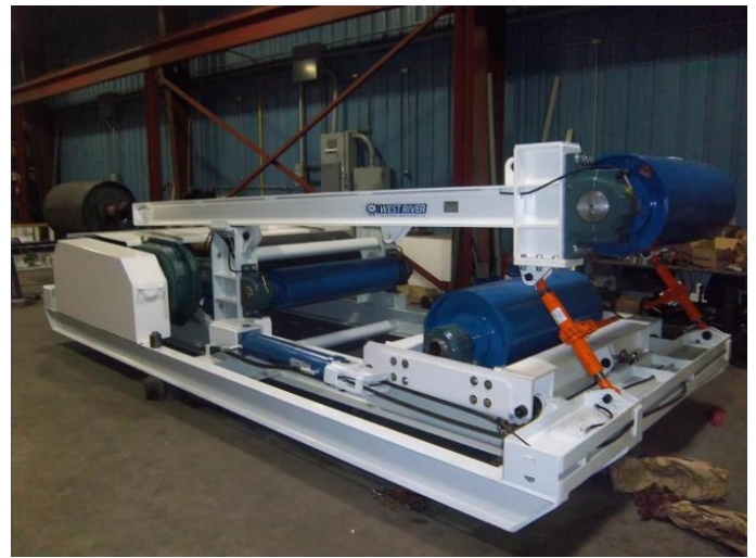
West River 150HP Combination Drive/Take-Up