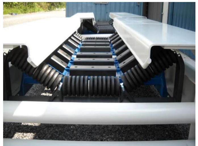
Feed Thru Tail Section