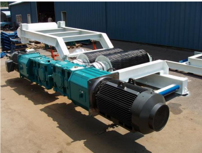
West River Dual 300HP Alignment Free Drive