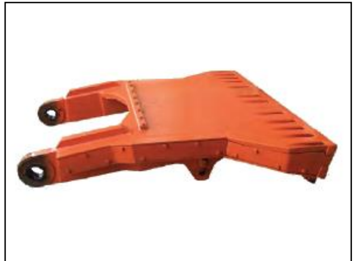
O'Neal Rebuilt 14CM15 Cutter Boom for 38" Head