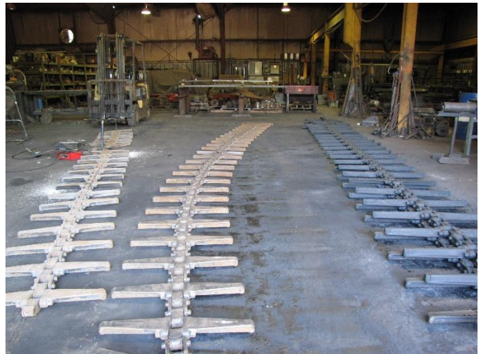
Miner Conveyor Chain Being Assembled