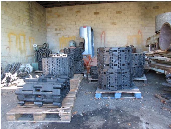
Rebuilt Crawler Chains Ready for Shipment