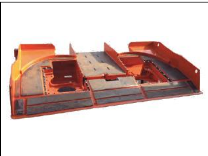
Rebuilt Joy 14CM15 Pan