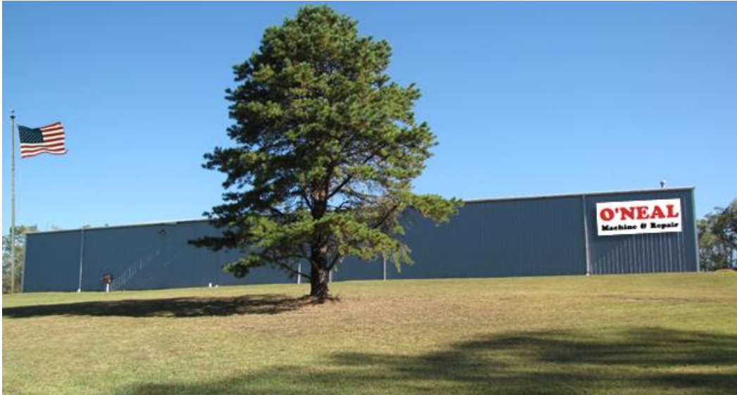
O'Neal Machine & Repair 22,000 Sq. Ft. Building