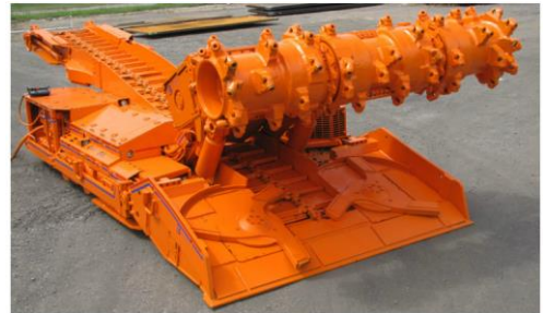
CAI Rebuilt Continuous Miner