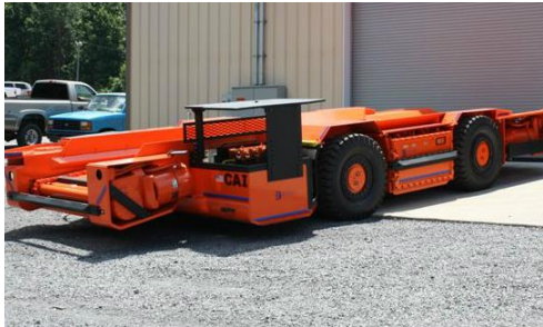
CAI Shuttle Car