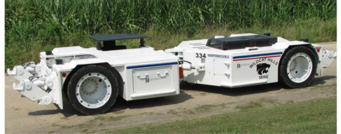
CAI Diesel Tractor