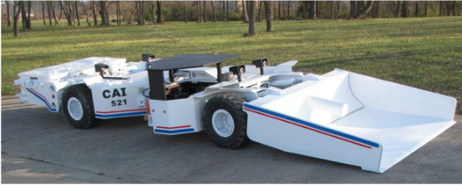
CAI Low Seam Battery Scoop