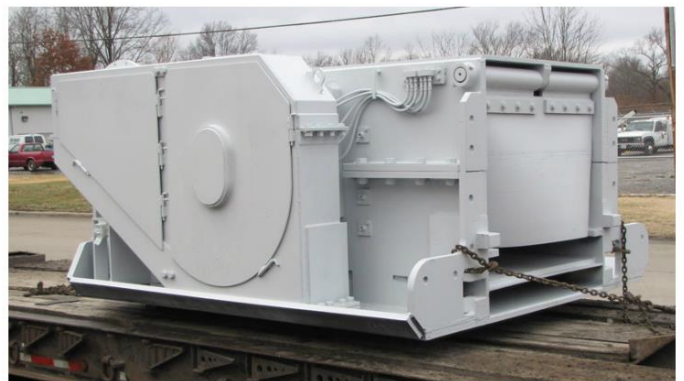
CAI Stageloader Crusher